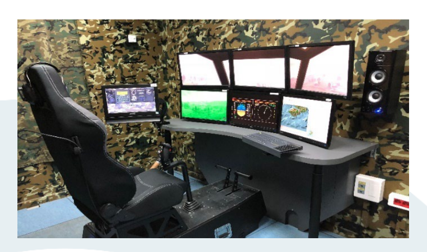
Aircraft Pilot Post