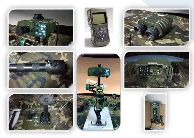
Emulated organic elements