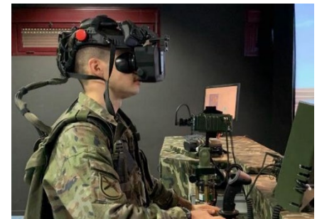
Virtual Reality Glasses